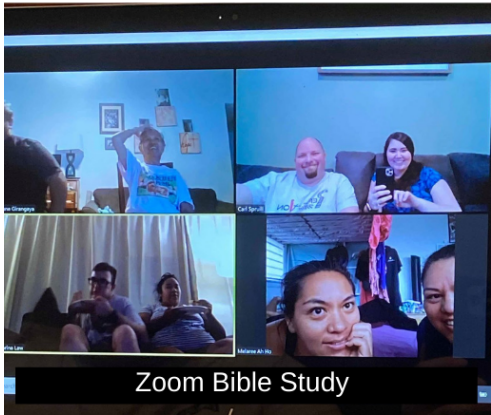
Zoom Bible Study