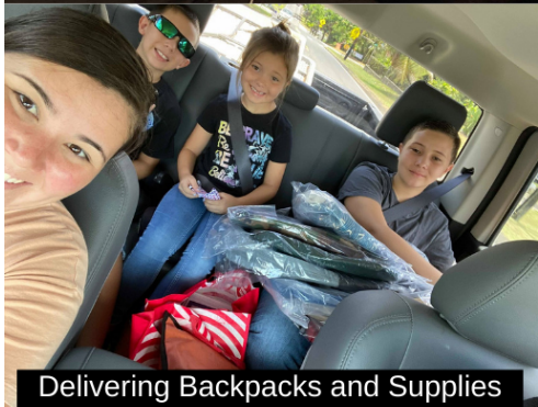
Delivering Backpacks and Supplies